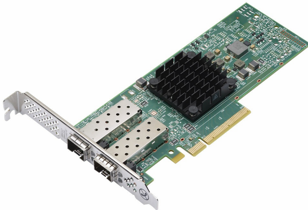
Figure 1. ThinkSystem Broadcom 57414 10/25GbE SFP28 2-port PCIe Ethernet Adapter

The following figure shows the 2-port adapter.